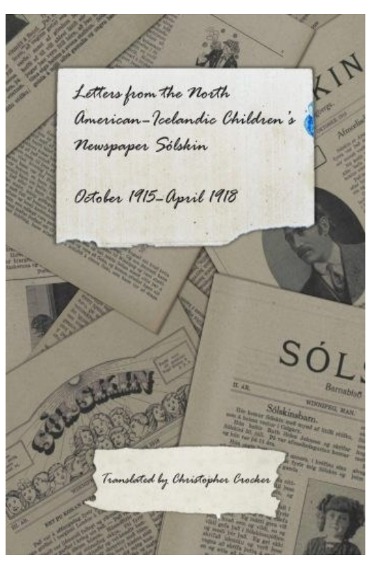
Figure 39: Cover from the book Letters from the

letters have been added to an Open Educational Resource through Pressbooks making them publicly available to read or work with. Letters from the North American-Icelandic Children's Newspaper Sólskin is a collection of 155 letters that were sent to the editor of the Winnipeg Icelandic language newspaper Lögberg from children of various ages, between October 1915 and April 1918. The letters are grouped by publication year and within these groups you can find the names and dates of each submission with both the original Icelandic text as well as the English translation.