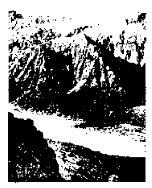
Mountains 4,000 feet high made of a tilted pile of basalt lavas, -S.E. Iceland

contrasted facies of volcanic rocks go into the make-up of eastern Iceland. One, a central volcano facies, is characterised by an abundance of rocksrhyolite and andesite lavas and pyroclastics†—other than basalt lavas, an