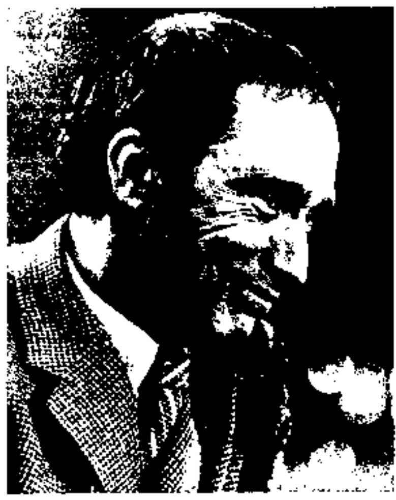
RT. HON. PIERRE ELLIOT TRUDEAU Prime Minister of Canada

ber Pass, been jailed by mobs in Jeru-Ganges."