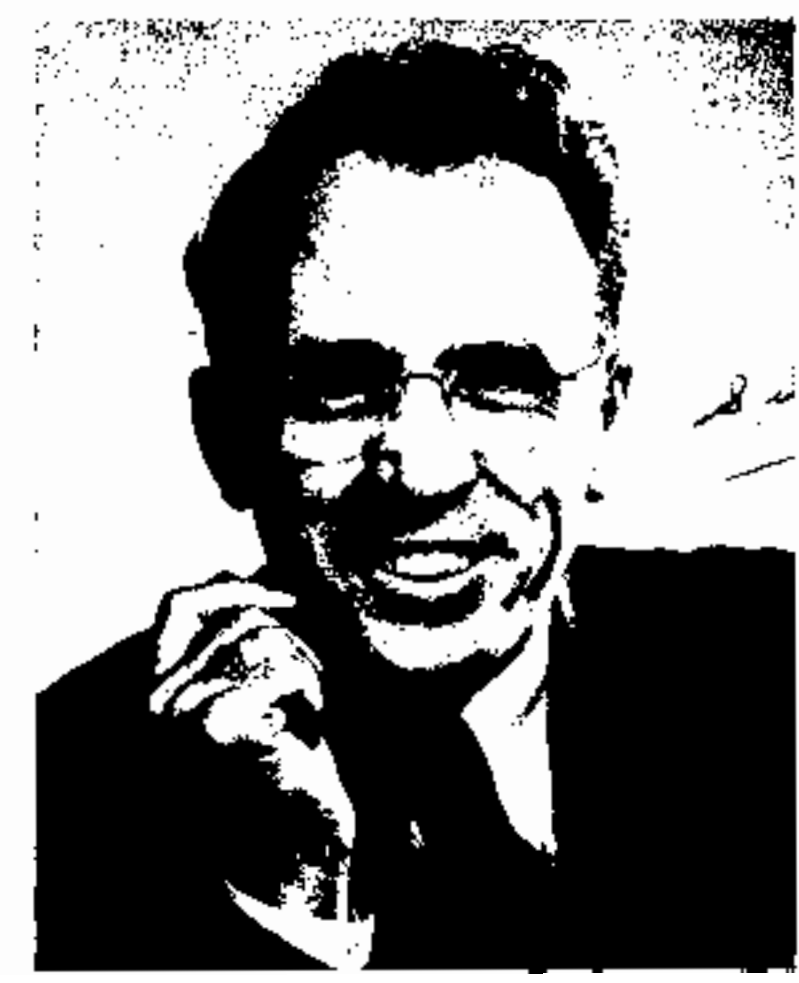
HON. THOMAS C. DOUGLAS Leader of the New Democratic Party of Canada