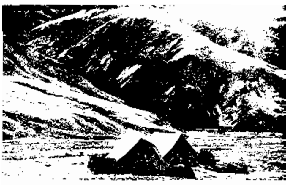
Geological camp site in south eastern Iceland

N.E. Ireland, Scotland, the Faeroes, mechanism and products of volcanic Iceland and Greenland were until eruptions under glaciers have been inquite recently thought of as remnants vestigated. of a once-continuous lava plateau stretching right across the North Atlantic (figure la). Then as more work was done it seemed more realistic to lava lenticle, as suggested by Figure 1b. fied to take account of the likelihoodor fact-that the Atlantic Ocean oc-