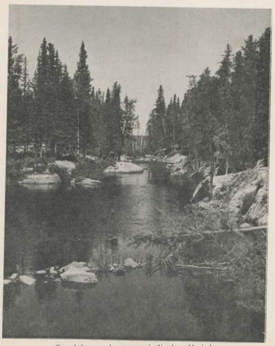
One of the many beauty spots in Northern Manitoba