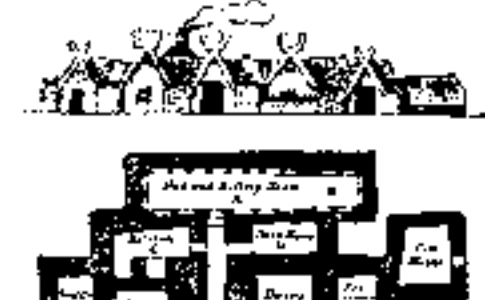
Early Icelandic pioneer homes

One group came directly to Milwaukee and soon two colonies of Ice-