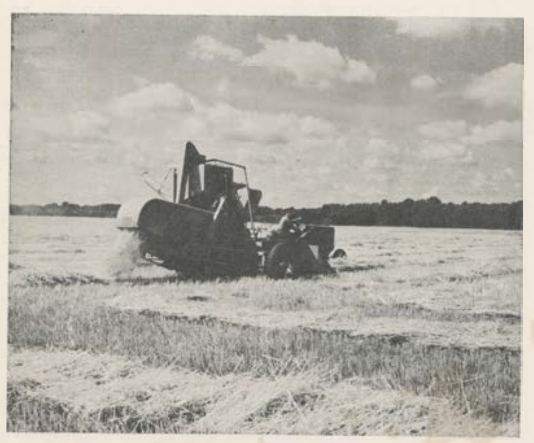
Harvest Scene in Western Canada