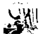
A busy viking Kent - Business is always a hot on bats - not only is he the restaurateur of Nautic Trails - he also a boat builder. / page 16