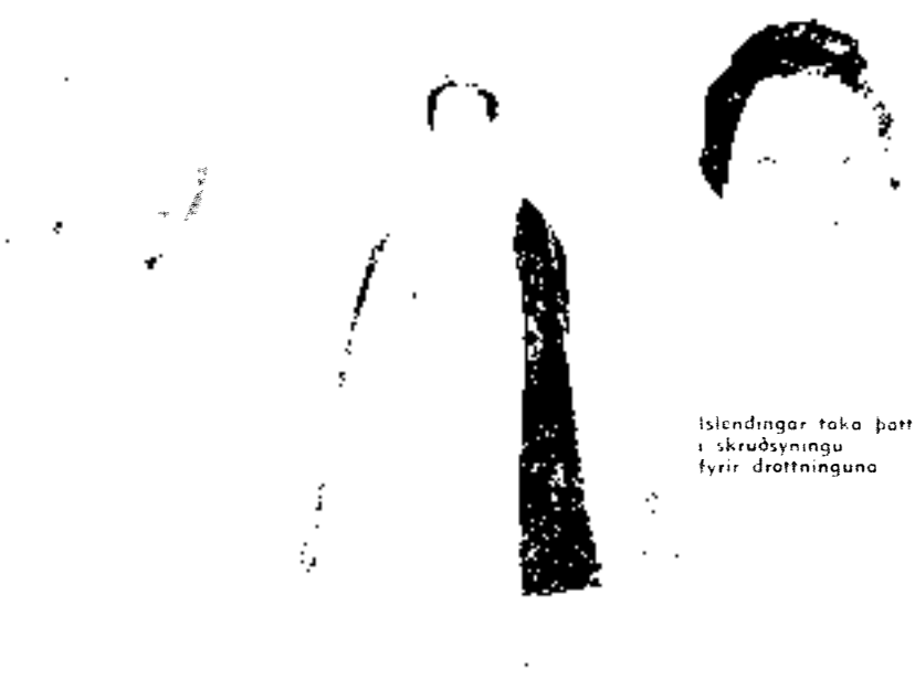
Íslendingar taka þátt í skruðsýningu fyrir drottninguna