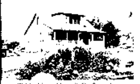
C:u ashioned hospitality & modern

Below is the final portion of Guttormur's piece where we can discern the comedic satiric nature that has been translated from a dire ironic outlook on