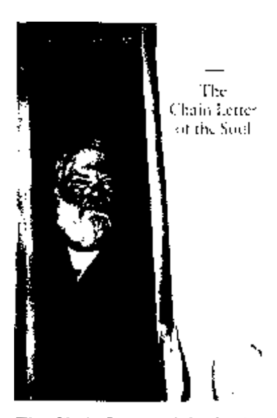
The Chain Letter of the Soul New and Selected Poems