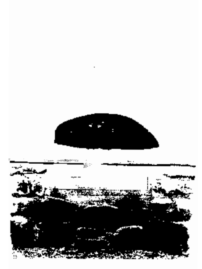
'Áðgat skal höfð Í nærveru sálar" 'Care should be taken in the presence of a soul" La présence d'une âme appelle le respect"