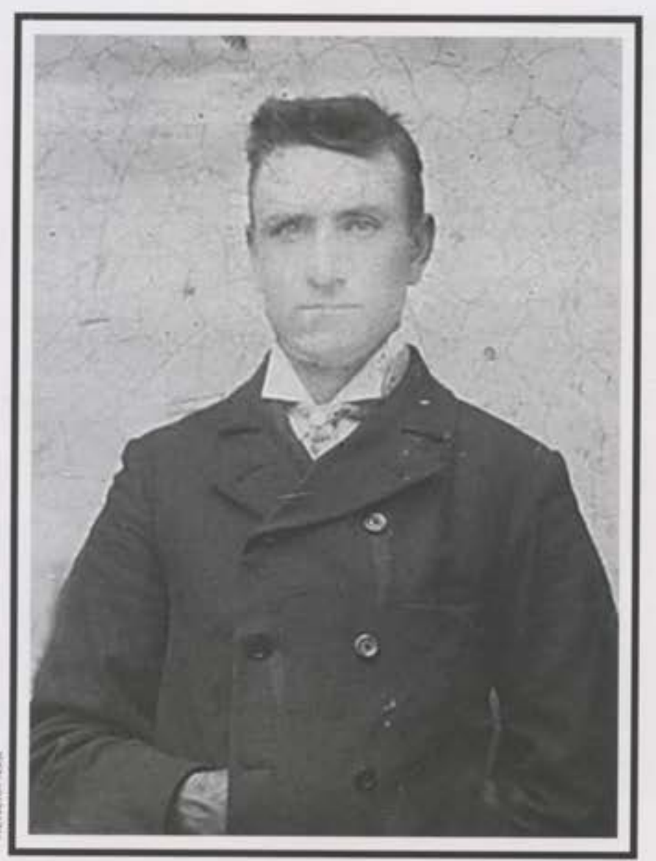
Vol. 63 #2 (2010)