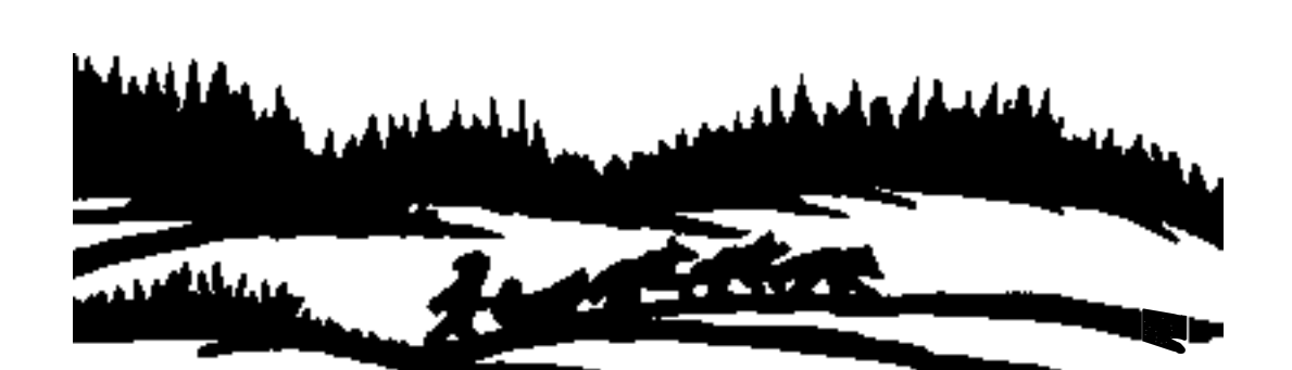
Drawings by Einar Vigfusson

Now that the boat had gone each man felt a certain amount of loneliness. They knew they would be pretty well isolated for the next few months, away from family and friends and maybe girlfriends whom they would not see during this time. The only real connection to home would be through letters which could be sent and received at the post office at a place called Poplar River on the mainland, approximately twenty-five miles to